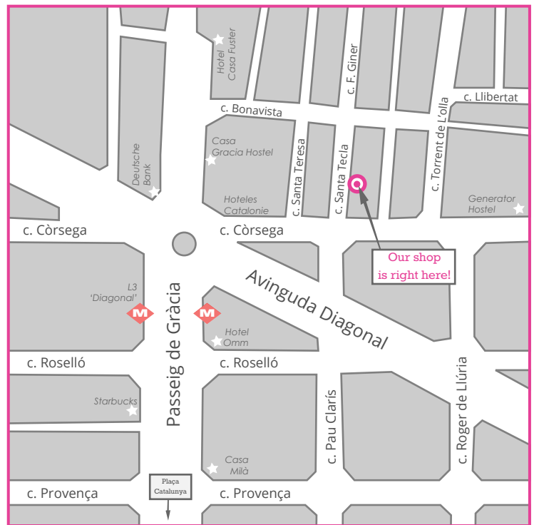
Cruising Barcelona · c. Santa Tecla 7 · 08012 Barcelona phone: (0034) 935 187 533